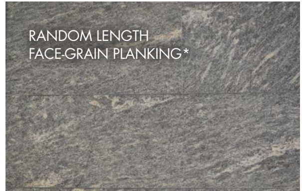
RANDOM LENGTH FACE-GRAIN PLANKING*