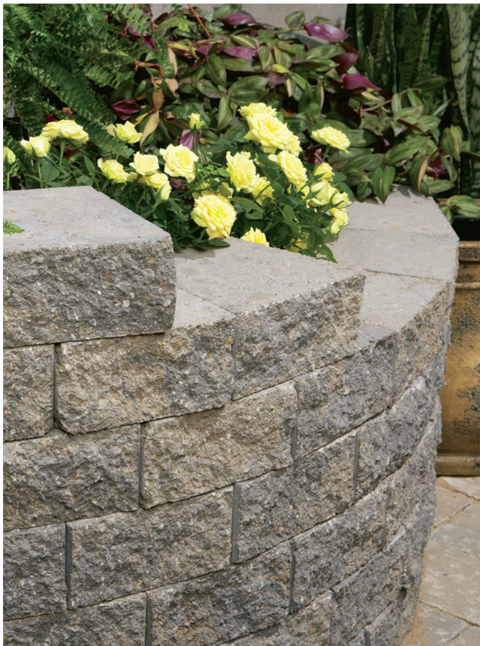
Wall: Modeco One, Chartan