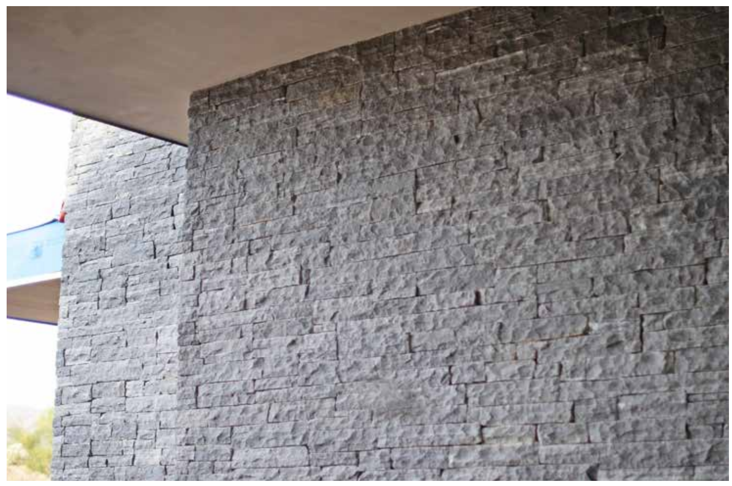
PICTURED ABOVE: WESTERN BLACK