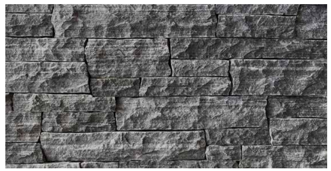
Western Black is a striking black splitface ledgestone, with a beautiful texture that accentuates the stone's natural veining.