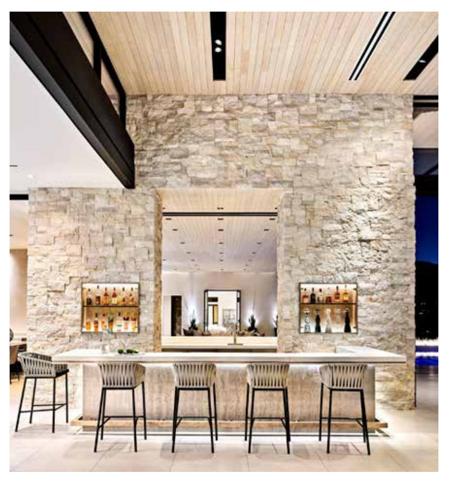
PICTURED: COVER AND LEFT: MESQUITE QUARRY BLEND; ABOVE: JERUSALEM GRAY GOLD ASHLAR

With our Elevations Collection, you can complement any space with premium, thin natural stone veneers. Carefully sourced materials bring earth's natural beauty into your space, adding dimension and intrigue to any indoor or outdoor project.